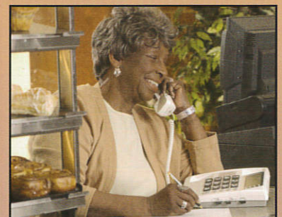
Captioned Phone User